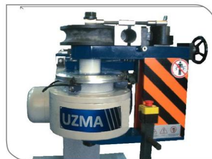
Manual clamp & manual angle adjustment with switch system (Standart)